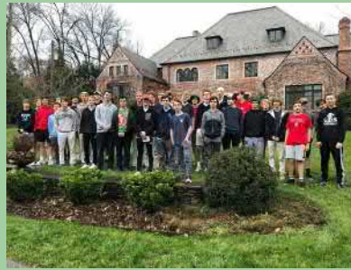
The Arc Junior Connection